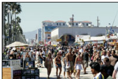
The Venice Ocean Front Walk's background is explained during the Venice Walking Tour.